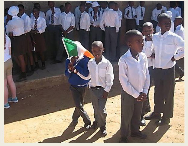
We had an early six a.m. start to begin the Sunday, but I didn't mind getting up to the warm sunshine and the knowledge of the amazing activities that were involved in the next few hours.

Through London, we finally arrived safely in Johannesburg where we had to wait around for a few hours to get our car hire sorted. And so began the gruelling eight-hour car journey which really felt like eight days. After two food stops and getting through the headache-inducing border control we eventually made it into Maseru city. The welcome we received was unbelievable as we were greeted by flags and songs and smiles all around.