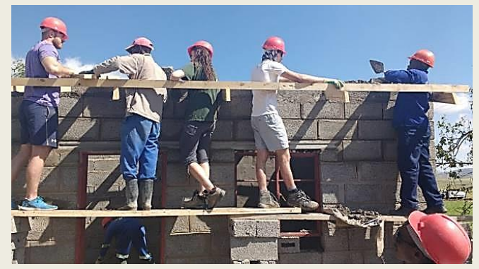
Once we had finished work on the houses, we returned to South Africa, and once everyone had recovered from food poisoning we all managed to enjoy a trip to a safari and to the water-park in Sun City. The trip had a hugely positive impact on everyone involved, and signing up for next year's trip (or a similar one organised outside of school) is something I would strongly advise anyone to do."