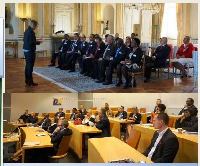
The visiting Ambassadors to Stockholm and Uppsala engaged with Swedish public officials, academics and the business communities on matters of mutual interest in over two days.