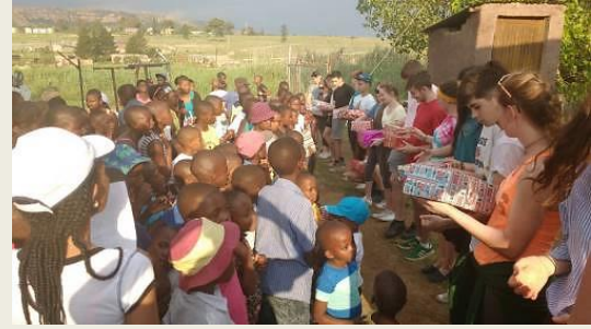
Though the work was hard, it was extremely rewarding, and we learned so much from talking to the villagers and playing with the children. Our visit to the headquarters of the national partners of Team Hope to hand out gift-filled shoeboxes was also incredibly eye-opening, and for many was one of the highlights of the trip. Our experience in Lesotho was amazing and will not be forgotten by anyone on the team.

Accompanied by five teachers, we flew via Ethiopia to Johannesburg, where we stayed for one night before travelling to Lesotho. The kingdom of Lesotho is a beautiful, mountainous country. Landlocked by South Africa, it has the fifth lowest life expectancy and second highest AIDS rate in the world (one in five adults living with AIDS). 60% of Basotho people are living in extreme poverty. Once there, we worked hard for five days to finish two houses for two families in the village of Mathebe.