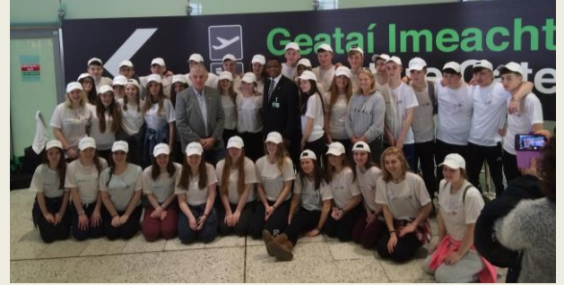
As families hugged and said their goodbyes I managed not to tear up as I walked through the gates into security.

e left for Lesotho on the fifth of February 2016. As all forty students gathered at the airport it still hadn't sunk in that I'd be leaving home for two weeks and travelling hundreds of miles away to Lesotho in Southern Africa.